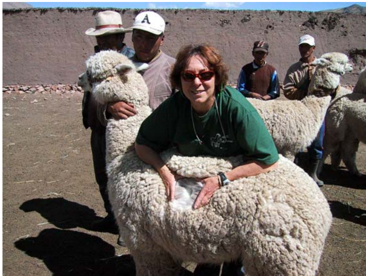
Learning about Alpacas in Peru