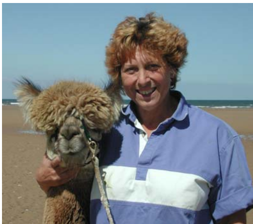
Alpaca walking on Holkham Beach, Norfolk